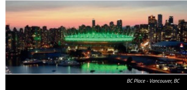
BC Place - Vancouver, BC

From East to West, landmarks across Canada light in support of Green Shirt Day and organ donors.