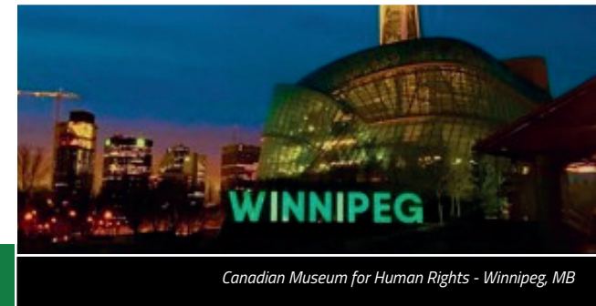
Canadian Museum for Human Rights - Winnipeg, MB